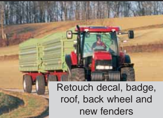
Retouch decal, badge, roof, back wheel and new fenders

Road Mode allows the tractor to be driven just like an automatic car with up to nine gears shifted up or down smoothly without need for driver input