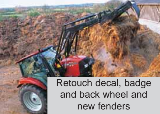
Retouch decal, badge and back wheel and new fenders

Field Mode automatic shifting in any of the three field ranges allows the transmission to shift up and down to optimise productivity for a given engine speed, leaving the driver free to concentrate on the implement and the quality of work.