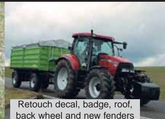
Retouch decal, badge, roof, back wheel and new fenders