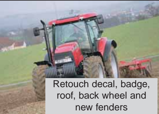
Retouch decal, badge, roof, back wheel and new fenders

Field Mode automatic shifting in any of the three field ranges allows the transmission to shift up and down to optimise productivity for a given engine speed, leaving the driver free to concentrate on the implement and the quality of work.