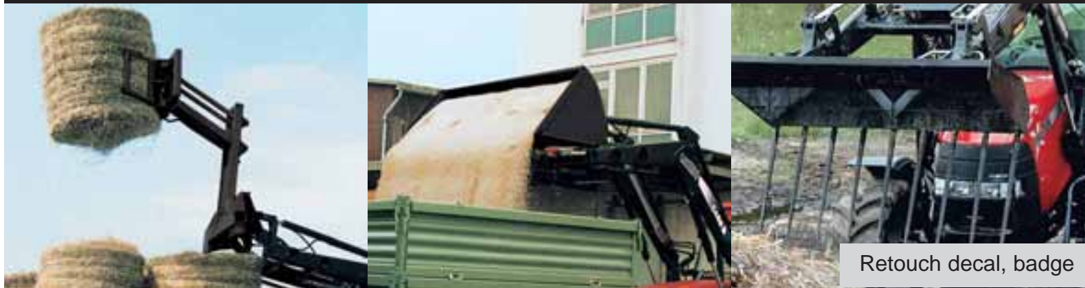
Retouch decal, badge